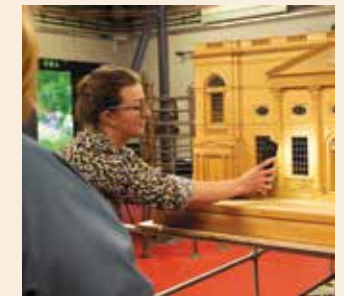
Local History Centre tour

Wednesdays 29 May and 11 September Tours 10am, 12pm and 2pm Booking essential