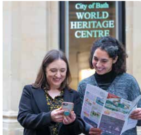
Left: Investigation Zone, Clore Learning Centre Above: Bath World Heritage Centre

i Find out more at bathworldheritage.org.uk