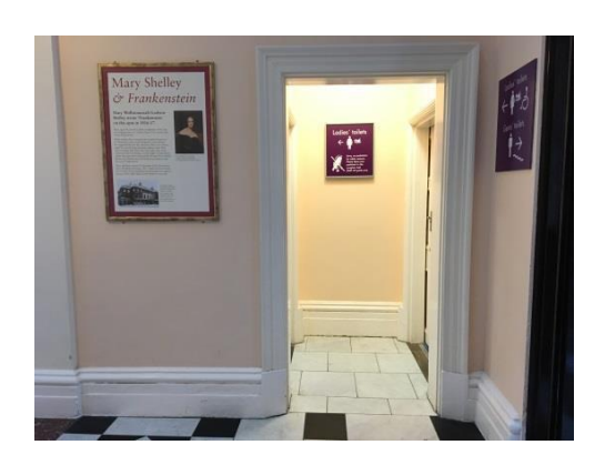
Entrance to Ladies and accessible toilet