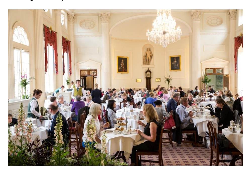
The Pump Room Restaurant

The Pump Room Restaurant is in the same building and is found along the corridor to the right as you come in the building. You may need to wait to be seated at the desk if you wish to use this Restaurant. There are musicians who play here during the day.