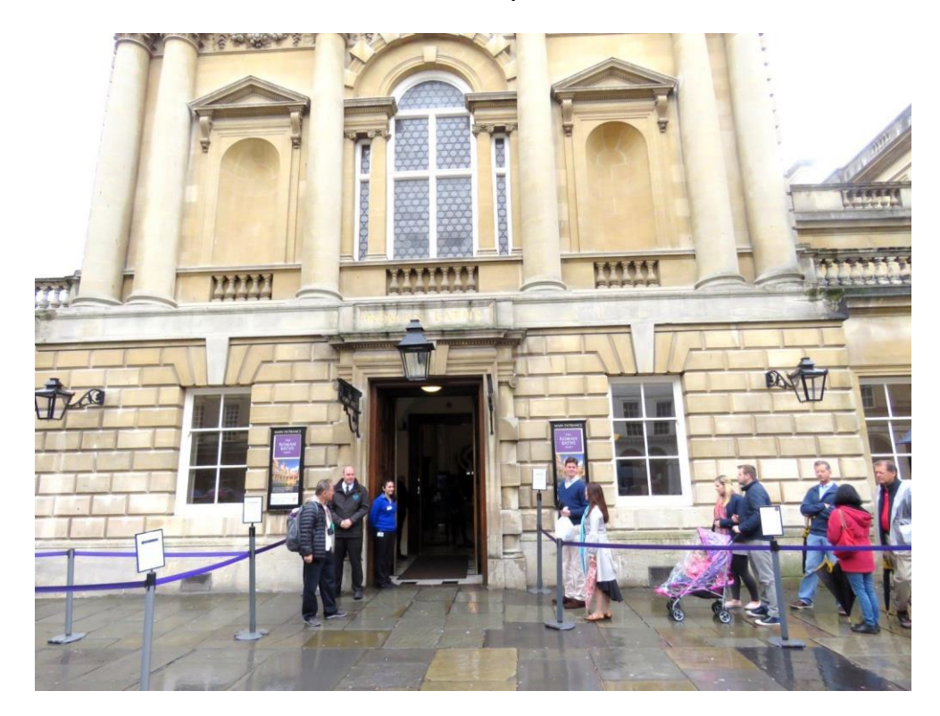
Roman Baths entrance on Abbey Church Yard

The Roman Baths main entrance is in Abbey Church Yard.