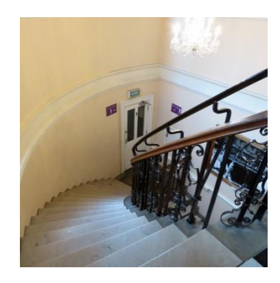
Stairs to Gents toilets

There are "Dyson" hand dryers in the toilets that make a loud noise.