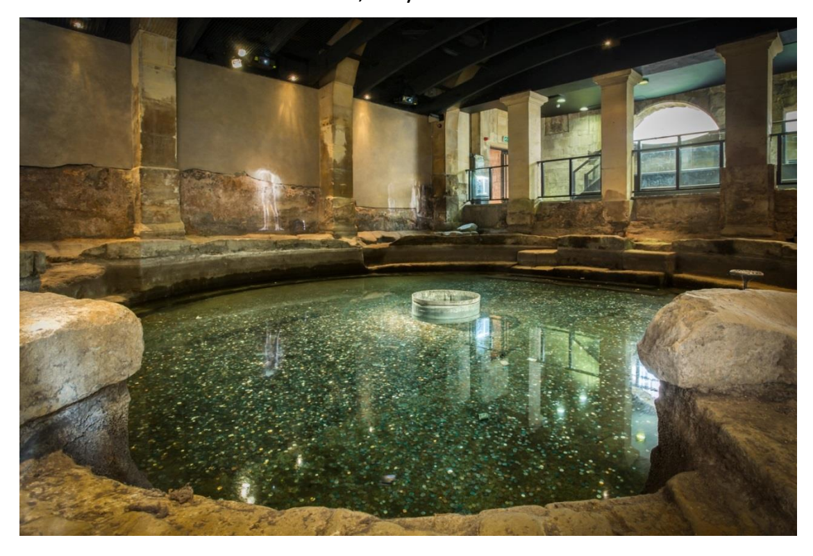
The West Baths

Opposite the Circular Bath, there are a few steps up to a raised walkway to your right, from which you can see the King's Bath. You may notice that there are coins in the Circular Bath – people throughout the centuries have felt moved to throw a coin into bodies of water, maybe to make a wish!