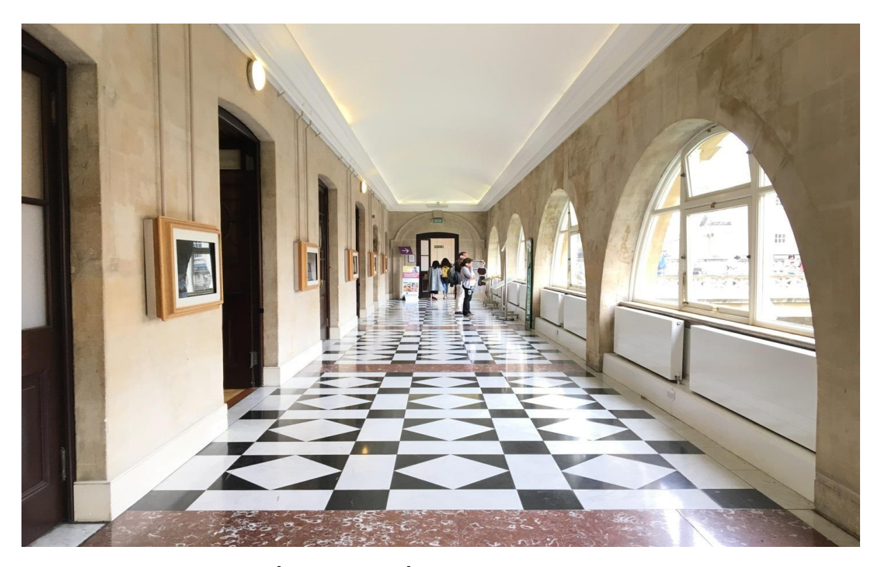
The Inner and Outer Terraces