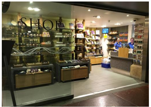
The spring overflow