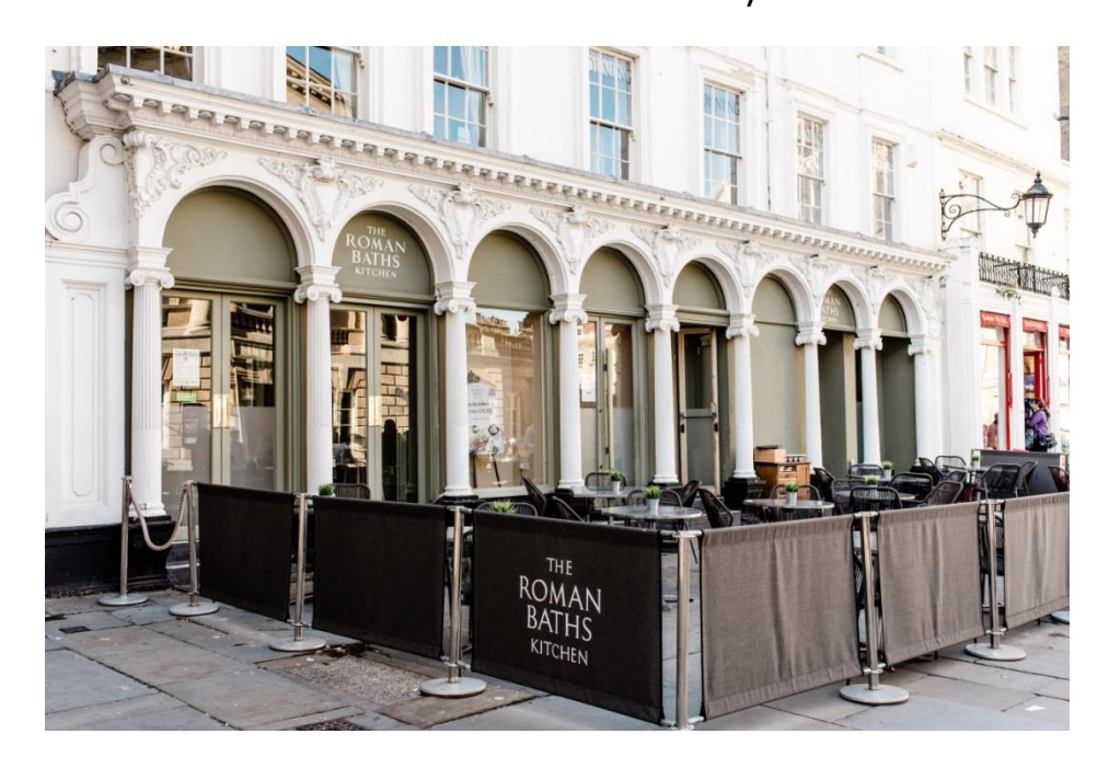
Roman Baths Kitchen restaurant

The Roman Baths Kitchen restaurant is across Abbey Church Yard.