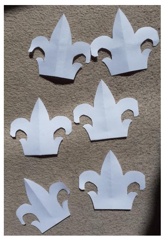
Well Done! You have made a crown like King Canute's.