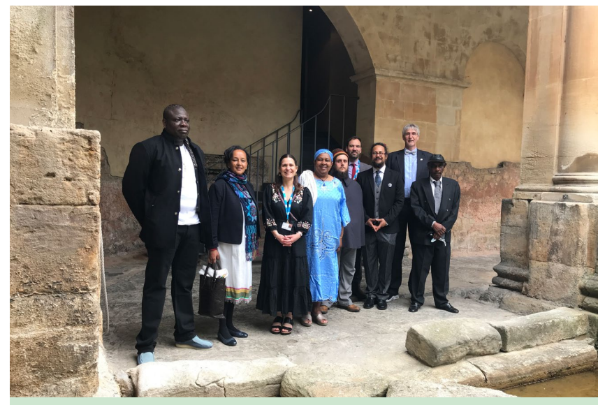
Princess Esther Selassie Antohin's visit