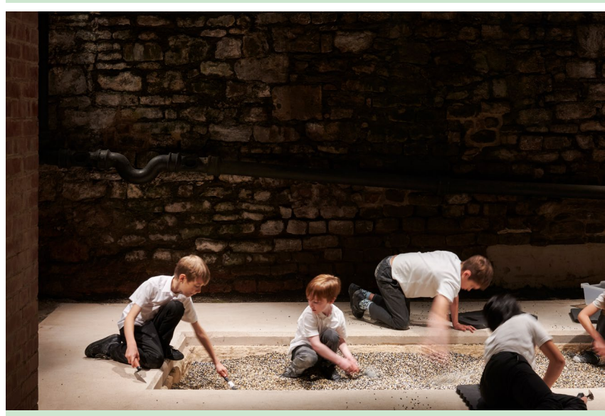
Clore Learning Centre opens to schools and community groups