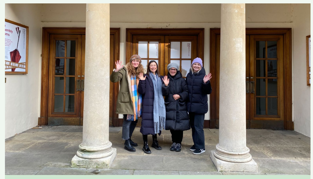
Fashion Museum team wave goodbye to the Assembly Rooms

After 59 glorious years, the Fashion Museum closed its doors for the final time at the Assembly Rooms on 30 October 2022. The curatorial team spent many months carefully packing up the collection and working with colleagues to ensure 100,000 objects were safely transported to a new temporary home at the headquarters of luxury glovemakers Dents in Warminster. The Fashion Museum collection will be housed at Dents while we embark on a major development project to create a new museum at the Old Post Office in the centre of Bath and a fashion collection archive in partnership with Bath Spa University.