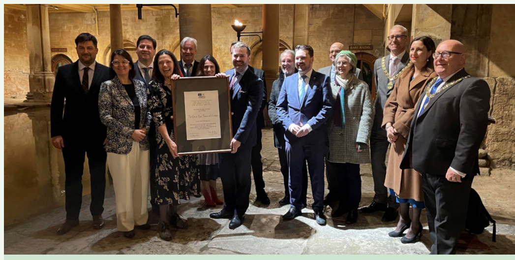
The Council receiving the UNESCO certificate at the Roman Baths

At the end of March 2023 the World Heritage function transferred to the Planning Service. Key challenges such as delivering the World Heritage Centre and the Great Spa Towns of Europe inscription have been achieved, and the main focus of work moving forward will be on engaging with place-based issues such as achieving carbon neutrality and greening the city.