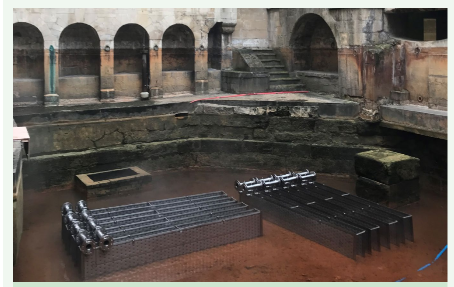
King's Bath drained with energy blades

16 three-metre-long energy exchange blades were installed into the King's Bath between 28 February and 9 March 2023. In installing the scheme, great care was taken to protect the integrity of the Spring. The Energy Capture Scheme will now save 850 tonnes of Carbon over a 25-year period (34 tonnes a year).