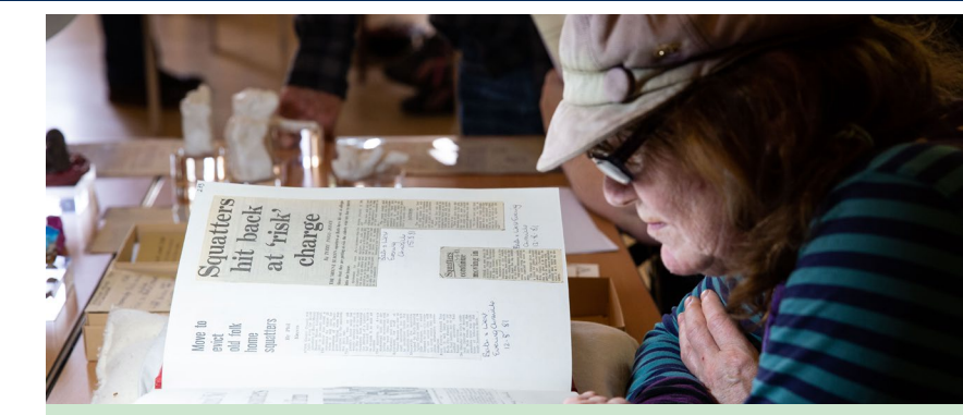
Imagine – A Hundred Years of Homes in Bath event